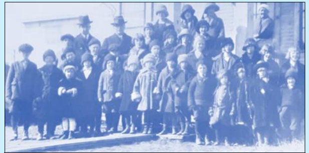
1923 – Sunday School: Beginnings of Our Church