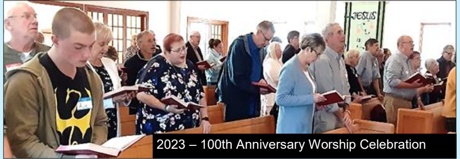
2023 – 100th Anniversary Worship Celebration